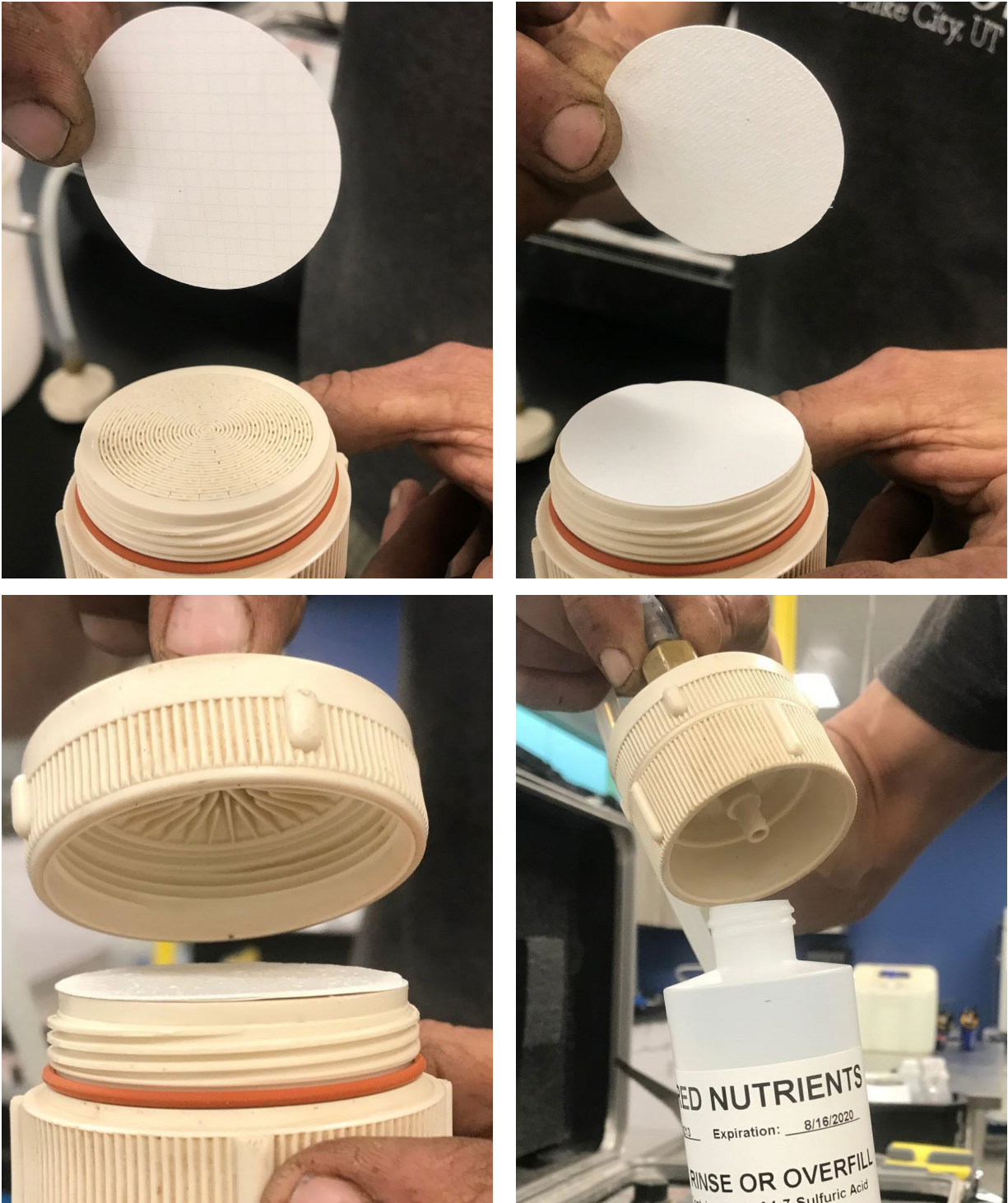
Figure 1: Membrane Filter Set-up: Gridded side down.